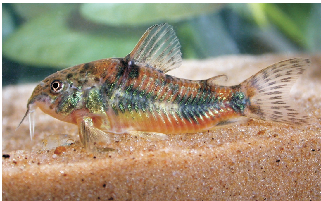
Fig. 5. Corydoras cf. paleatus , MACN 9237, live specimens, 42.0 mm SL. Argentina, Salta province, small stream 200 meters from its junction with the San Lorenzo river (S 24° 47' 08" - W 65° 28' 10").

specimens, 29.6–37.0 mm SL, Argentina: Salta province, Lesser river, La Caldera Department, (S 24° 40' 39" – W 65° 28' 33"; altitude: 1463 m.a.s.l.). Coll.: P. Calviño & F. Alonso, January 17, 2006; MACN 9235, 9 specimens, 12.3–35.7 mm SL, same locality as MACN 9234, Col.: F. Alonso, January 2007; MACN 9236, 25 specimens, 27.8–37.9 mm SL, Argentina: Salta province, Gallinato creek, La Caldera Department, (S 24° 40' 59" – W 65° 17' 32"; altitude 1159 m.a.s.l.). Col: F. Alonso, January 20, 2006; MCNI 498, 5 specimens, 36.7–40.0 mm SL, Argentina: Salta province, La Caldera river, La Caldera Department. Coll.: Barrros and Rosa, February 5, 1995.