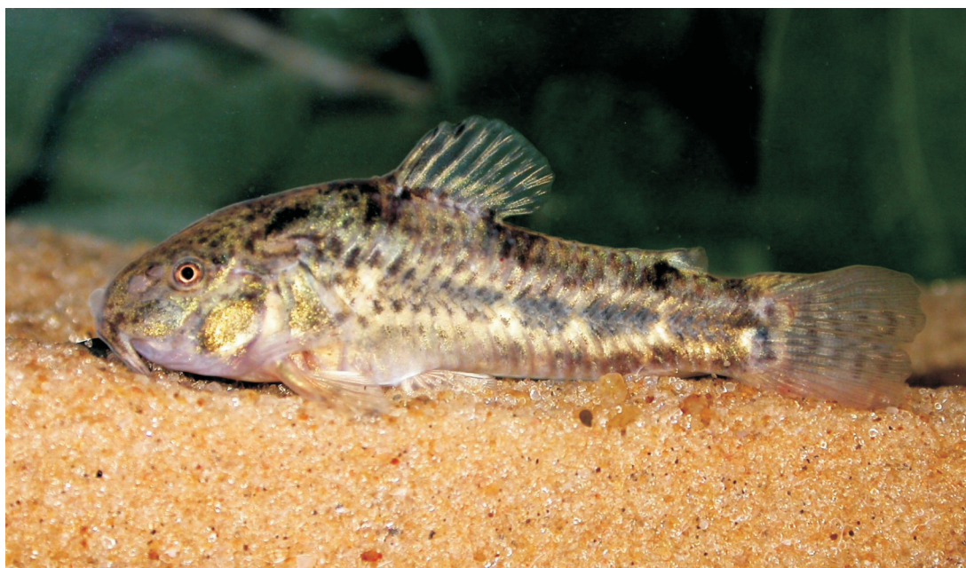
Fig. 1. Corydoras gladysae sp. n., MACN 9232, live holotype, 35.0 mm SL. Argentina, Salta province, Calchaquí river (S 25° 2' 59" - W 66° 6' 25").

Paratypes. MCNI 712, 4 specimens, 37.5–28.5 mm LE; Calchaquí river, Cachi Department, Salta province, Coll. Gonzo y Martínez, January 19, 2002. MCNI 913, 4 specimens, 37.5–27.6 mm SL; Calchaquí river, (S 25° 7' 17" and W 66° 9' 35"; Altitude: 2325 m.a.s.l.) Cachi Department, Salta province, Argentina. Coll. Gonzo and Martínez, December 7, 2003.