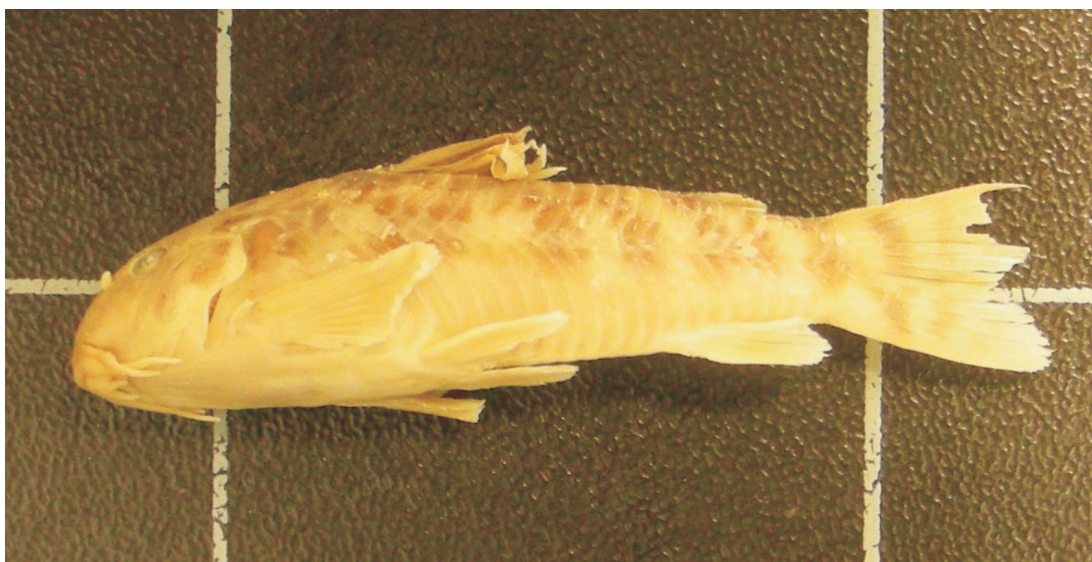
Fig. 3. Corydoras micracanthus, BMNH 1897.1.27.9-14, paralectotype, 38.1 mm LE; Argentina, Salta province.

praecipital process. Barbel yellowish or light brown.