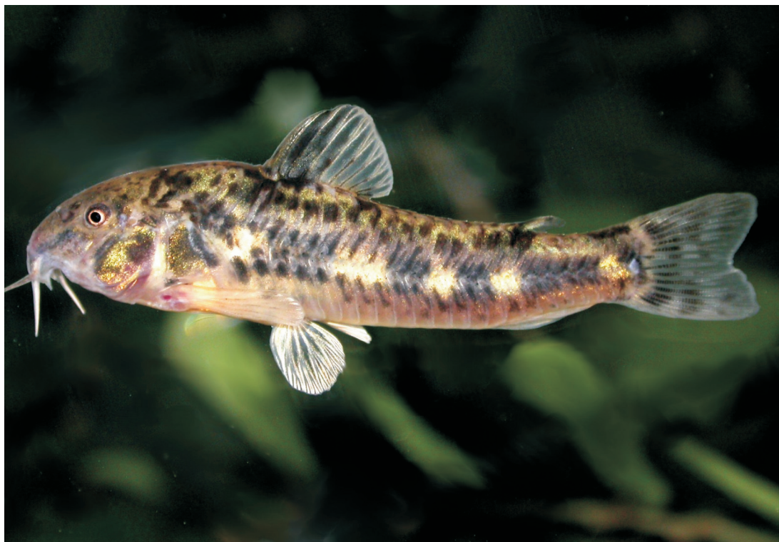
Fig. 4. Corydoras micracanthus , MACN 9234, live topotype, 35.1 mm SL. Argentina, Salta province, Gallinato creek (S 24°40'59" – W 65°17'32").

all its surface a great part of the year increasing its caudal in the summer, the rainy season. Nevertheless, near its junction in the San Lorenzo river, it has surface water all the year (pers. obs.), probably due to a subterranean water flow from this last river. The Lomas de Medeiros hills were the ancient alluvial cone of Wierna river (Igarzábal & Medina, 1991).