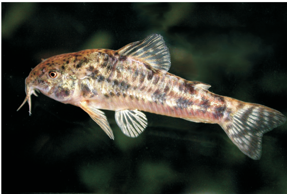
Fig. 2. Corydoras petracinii sp. n., MACN 9233, live holotype, 36.0 mm SL. Argentina, Salta province, San Lorenzo river (S 24° 47' 08" - W 65° 28' 10").

Calchaquí river, in the sub-Andean range system, at Cachi and Payogasta localities, in Cachi Department, Salta, Argentina (Fig. 6). This river is a tributary to the superior river basin of the Juramento river, that ends in Paraná river. According to Gonzo (2003), the Calchaquí river is the main collector of the Calchaquíes Valleys. This river and its tributaries conform a dendritic network of Atlantic drainage with a surface estimated at 14.175 km 2 and a perimeter of 640 km. Its layout fits into the disposition of mountainous cords and crosses intermountainous valleys of southern course. This river begins at the Nevado del Acay, at 5716 m.a.s.l., where it reaches its maximum height. Its length is 252 kilometers. The drainage network has a remarkable contrast between the East and west the latter with a greater number of affluents of permanent regime, oriented from West to East, and whose volumes are fed by defrosting water (Gonzo, 2003). The diversity of fish of this river is scarce, but most of them are endemic species, of limited distribution, sometimes only in certain sections of the water course.