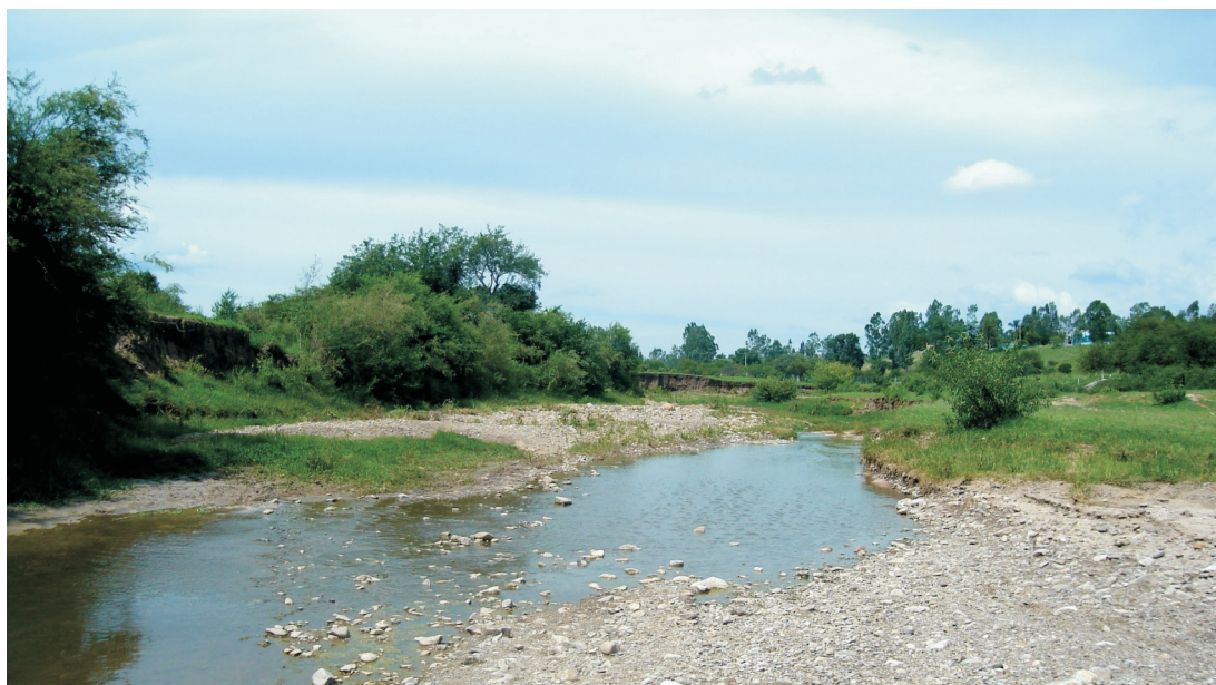
Fig. 7. Stream 200 meters from its junction with the San Lorenzo river (S 24° 47' 08" - W 65° 28' 10"; Altitude: 1222 m.a.s.l.), Finca Las Costas, around Salta city, Argentina.

Color in formol. Ground color of head grayish brown. Opercle dark brown or reddish grey. Preopercular edge light yellow. Ventral region of head light. Dark brown irregular blotch between opercle and parieto-supraoccipital process. Barbel yellowish or light yellow.