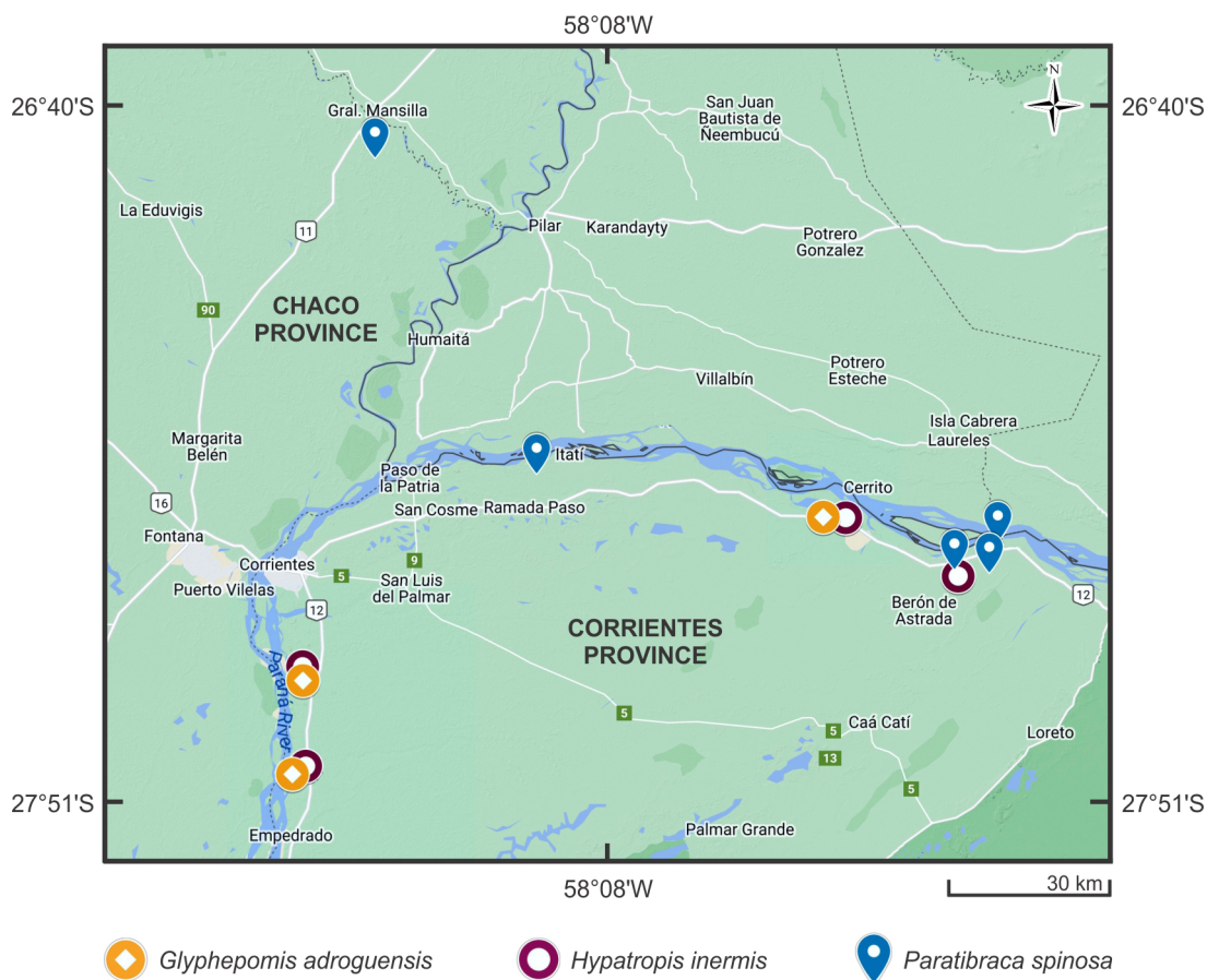
Fig. 2. Presence of the species Glyphepomis adroguensis , Hyapatropis inermis , and Paratibraca spinosa in target rice fields of northeastern Argentina.

1-XI-2017, Daniela Fuentes-Rodríguez leg., Tillering, manual sampling, 2 males; Empedrado (INTA), 9-II-2018, Flowering, manual sampling, Daniela Fuentes-Rodríguez leg., 2 females; Berón de Astrada (Adeco), 14-VII-2017, Daniela Fuentes-Rodríguez leg., post-harvest, manual sampling, 1 male.