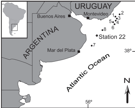
Fig. 1. Southernmost localities for Pteria colymbus and the new locality here reported: 1, Studer, 1889; 2, MACN-In 15936; 3, MACN-In 16810; 4, MACN-In 16662; 5, MACN-In 17632; 6, MACN-In 18195; 7, MACN-In 16712; 8, Pastorino et al. , 2007.

aboard the R/V Puerto Deseado on October 2009 (Fig. 1). All specimens were fixed in 10% formalin and preserved in 70% ethanol. In addition, morphometric parameters of new records and type material were measured with a digital caliper and listed in the Table 1. They are the antero-posterior length (APL), the greatest distance between the anterior and posterior over the dorsal margin of the shell and the dorsoventral height (DVH), the greatest dorsoventral distance measured from hinge line to the ventral edge. The relation APL/DVH is provided. Physical parameters were recorded and listed in Table 2. The latitude/longitude data were registered with a GPS Garmin. The sampling depth at each station was provided by the crew of the R/V Puerto Deseado and a Niskin bottle was used to collect seawater and to measure bottom temperature and salinity. Associated species are mentioned in Table 3 and identified based on the traditional catalogues and type material examination. Finally, material deposited at invertebrate collection of Museo Argentino de Ciencias Naturales (MACN-In) and Linnean Society of London (LSL) was revised. New collected specimens were housed at MACN-In and invertebrate collection of Centro Nacional Patagónico (CNP-Inv).